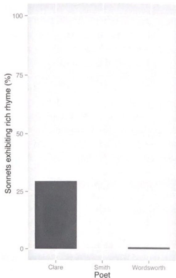
Figure 2. Rich rhyme in Clare, Smith and Wordsworth's sonnets

of his sonnets do have these features. Statistical analysis reveals, however, that this affectless poem illustrates trends that link his sonnets to Smith and the aesthetic of variety, and distinguish both Smith and Clare's sonnets from Wordsworth's. These three trends are: innovative rhyme-schemes, rich rhyme, and '&'.