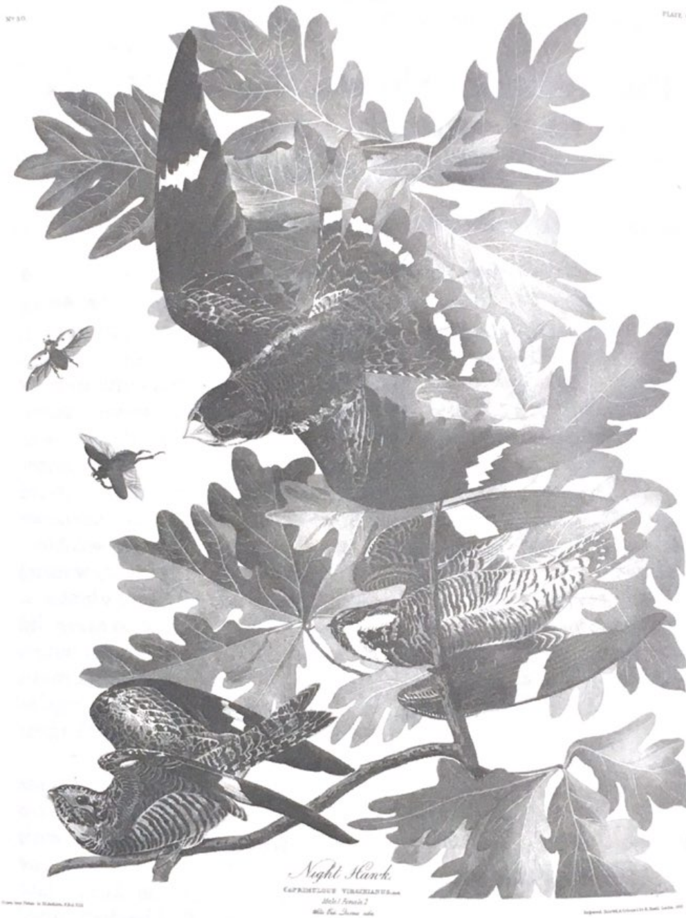
Illustration: John James Audubon's 'Night Hawk, Caprimulgus Virginianus ', an American cousin of Caprimulgus Europaeus, known by Clare as Night Jar, Fern Owl, Goat Sucker and Night Hawk (see Natural History, p. 32 and p. 32n4). Plate CXLVII, Audubon's Birds of America, published 1827-1838.